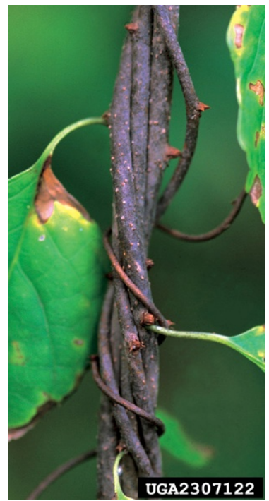
Twining vines with bark showing small, raised lenticels.