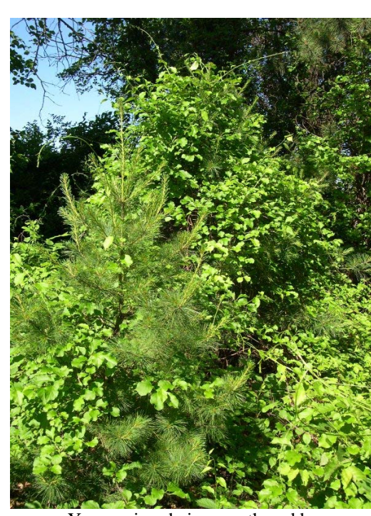
Young pines being smothered by Oriental bittersweet.

resources. It can twine tightly as it climbs, constricting and eventually girdling shrubs, tree limbs or entire trees as both continue to grow. Tangled mats of vines in trees can make them top-heavy and increase their susceptibility to wind and ice damage. Because Oriental bittersweet can hybridize with American