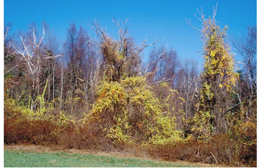
Climbing Oriental bittersweet damaging trees along a forest edge

winter, early spring or fall, preferably when native plants are dormant and will be unaffected. Vines can also be cut and a foliar spray used later on the resprouts.