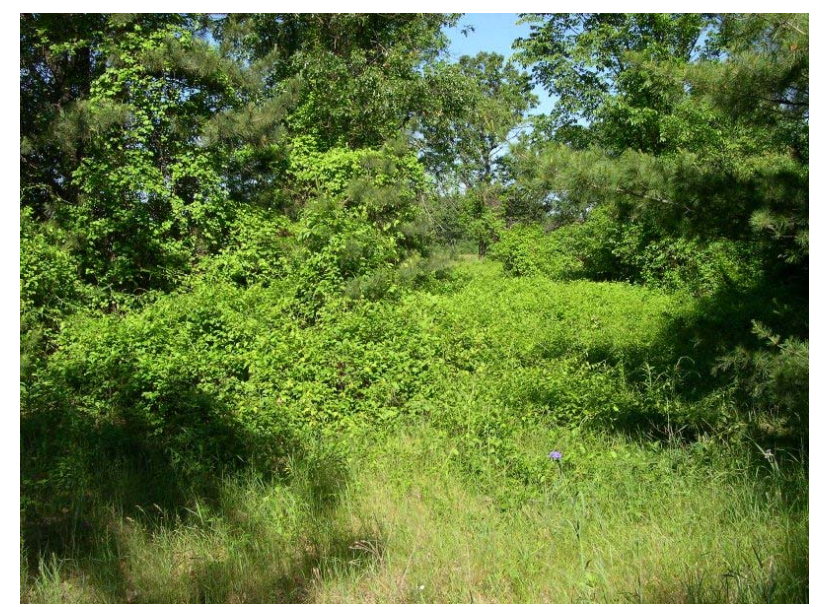
Roadside infestation sprawling over meadow, shrubs and trees.

Combination. Cut the vines low to the ground and apply herbicide to the cut stumps. Use triclopyr (12% active ingredient) with a non-toxic bark penetrating oil or glyphosate (20% active ingredient). Treat in