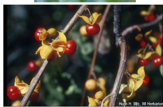
Fully ripe fruits.