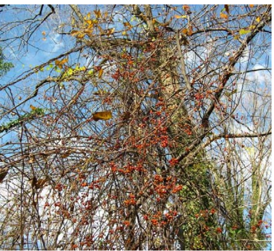
Climbing tangle of Oriental bittersweet laden with fruit.