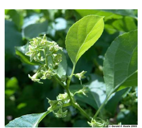
Flowers in leaf axils.

Plant Habit. This leafy, deciduous, sprawling, twining vine climbs up and over woody plants and other supporting objects. Its dense foliage can shade out existing vegetation. Stems. Vines are many-branched, light brown to gray in color, though new branches may be green. Surface of smaller branches dotted with tiny, lighter-colored bumps